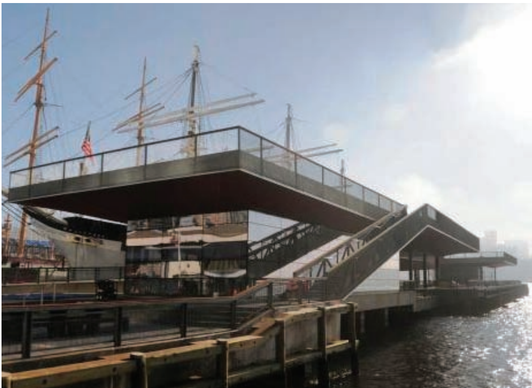
New waterfront construction at Pier 15.

Additionally, respondents should compare their approach to more conventional approaches using current engineering methods, construction techniques, cost factors, environmental regulations, and other factors which comply with current regulation.