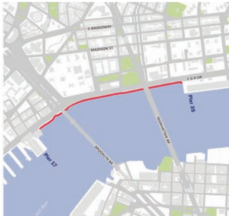
Lower Manhattan Waterfront