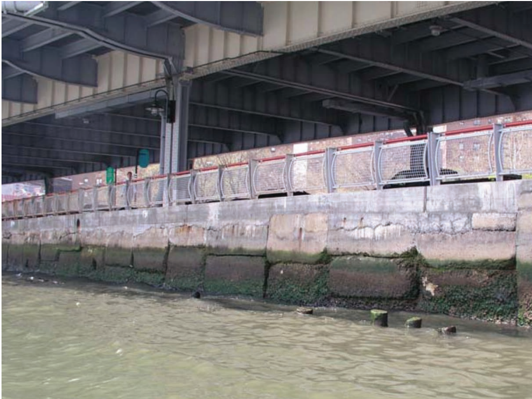
East River bulkhead with heavy spalling at joints.

Many of these structures include timber elements, which are susceptible to marine borer activity. Since the United States Clean Water Act was passed in 1972 the rate of deterioration due to marine borers has dramatically increased. While previous rehabilitation efforts involving wrapping timber piles with Polyvinyl Chloride (PVC) have proven ineffective, even the more effective concrete encasement solution requires rehabilitation over time. As with any aging infrastructure in the water, whether it is constructed with timber, concrete or steel, the structures will have to be rehabilitated or replaced, and historically this work is very expensive.