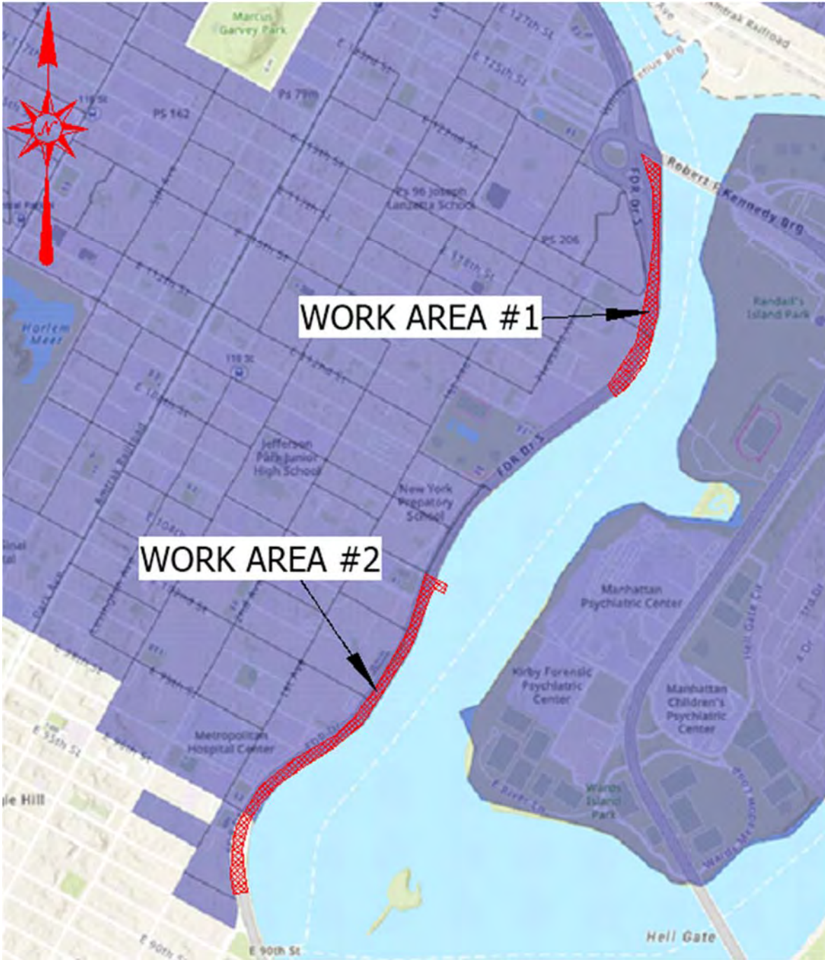
Figure 1. Project Location and Potential Environmental Justice Area(s)

(Note: This map was obtained from the NYSDEC database. The blue/purple-shaded areas represent Potential Environmental Justice Areas [PEJA]).