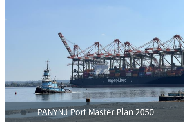
PANYNJ Port Master Plan 2050