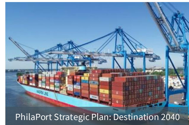
PhilaPort Strategic Plan: Destination 2040