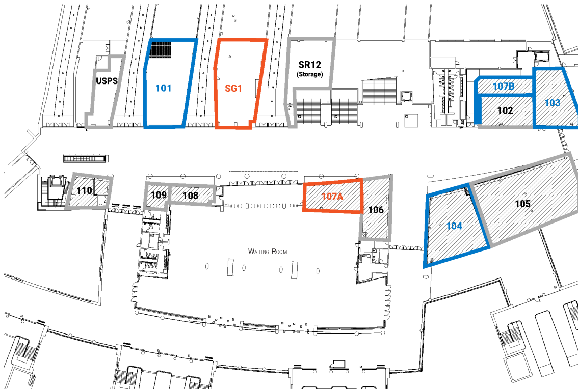
St. George Ferry Terminal