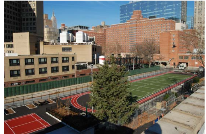
Asser Levy Park