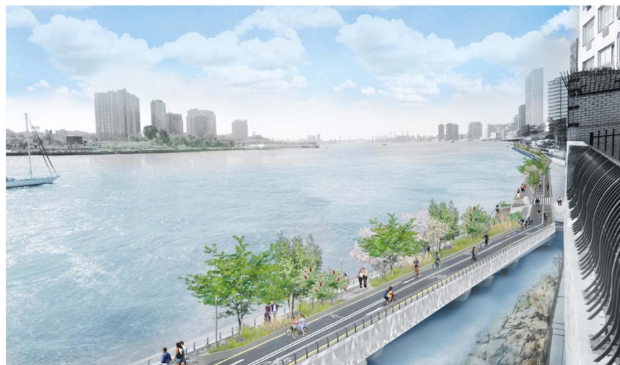
ODR and UN esplanades from Sutton Place looking south