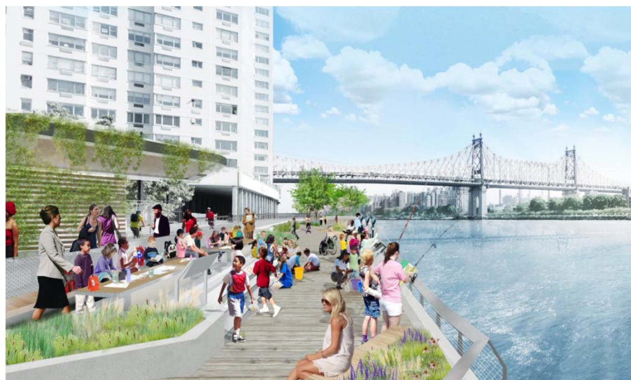
53 rd Street Node looking north