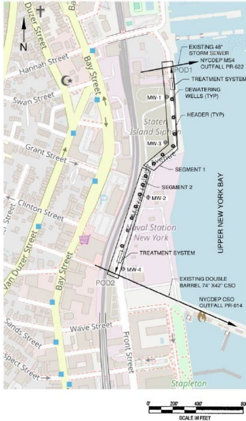
DEWATERING PLAN FOR NEW STAPLETON WATERFRONT DEVELOPMENT - NORTHERN & SOUTHERN PHASES STATEN ISLAND, NEW YORK September 13, 2023