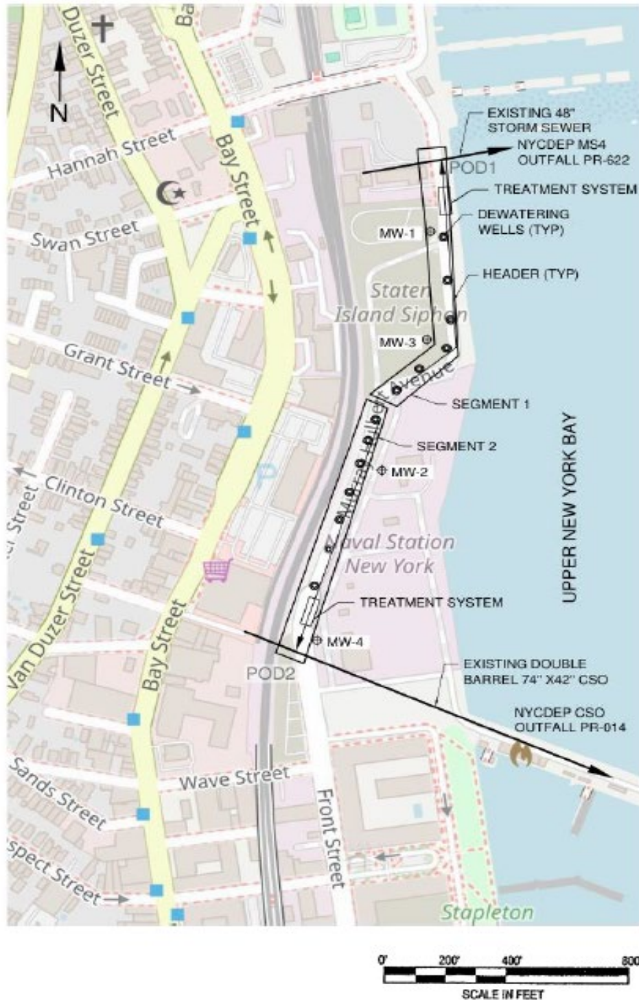
DEWATERING PLAN FOR NEW STAPLETON WATERFRONT DEVELOPMENT - NORTHERN & SOUTHERN PHASES STATEN ISLAND, NEW YORK September 13, 2023