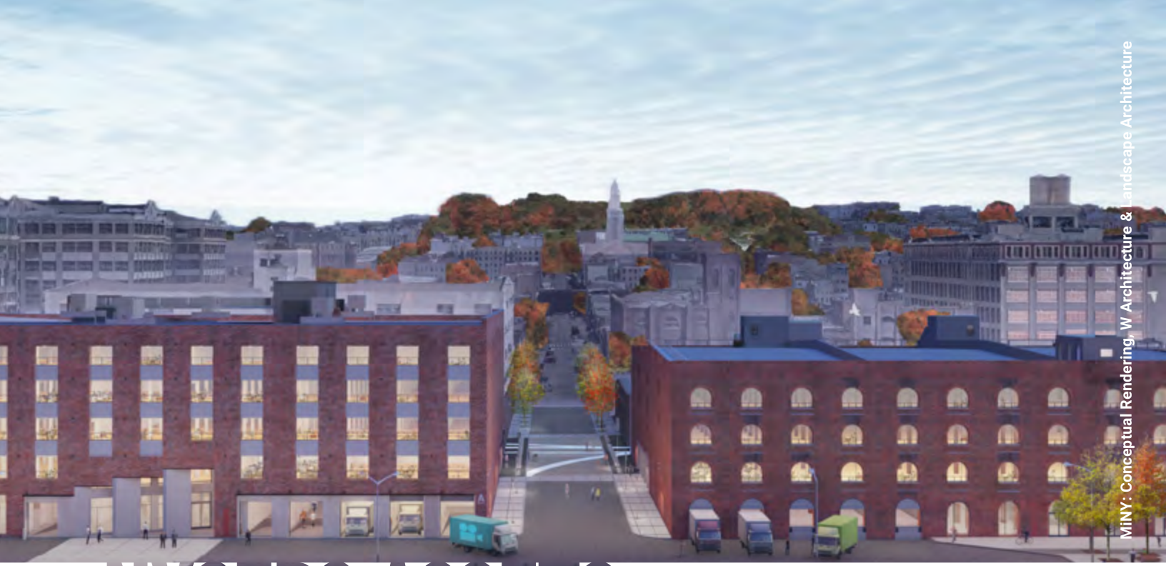
MiNY: Conceptual Rendering, W Architecture & Landscape Architecture