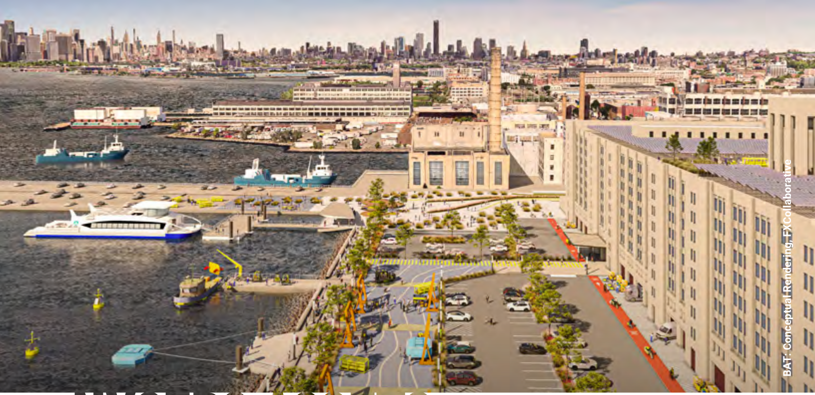
BAT: Conceptual Rendering, FXCollaborative