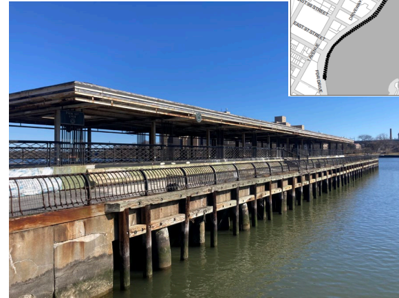
Existing Pier at 107 th St