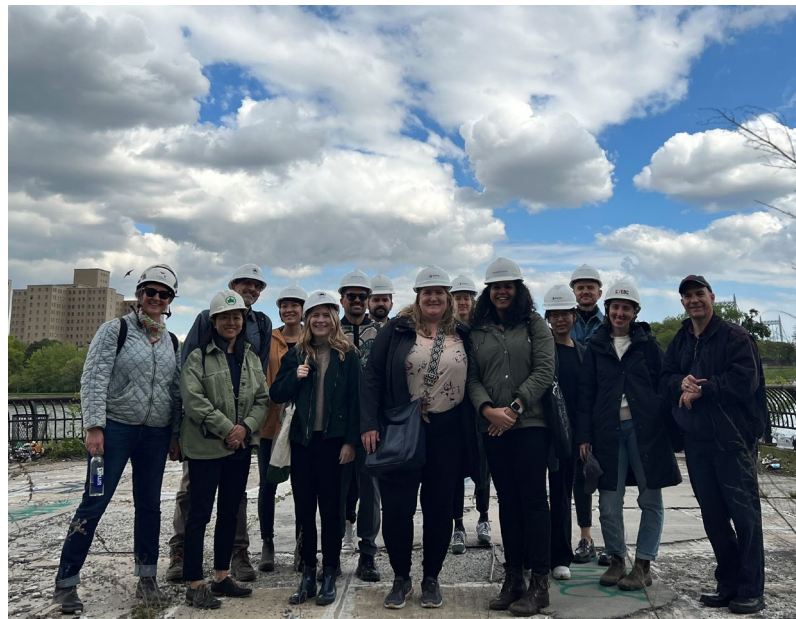
Project Team Pier Site Visit