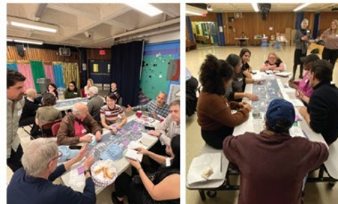
Workshop #1 – In Person