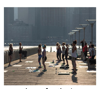
place of gathering