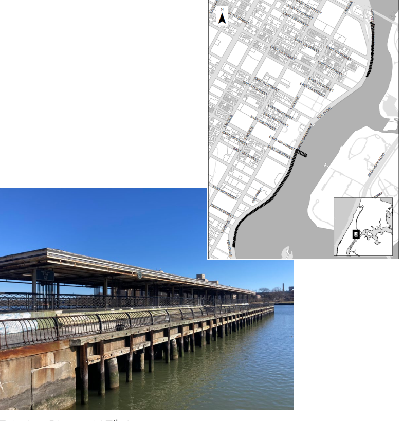
Existing Pier at 107<sup>th</sup> St