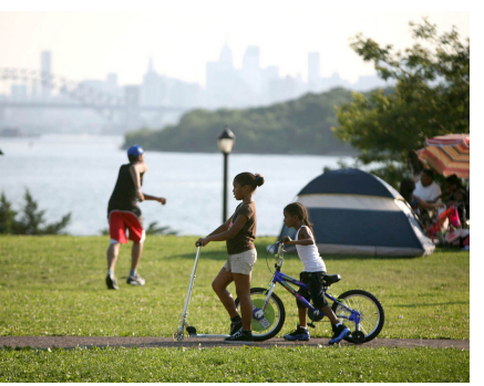
Barretto Point Park, opened 2006