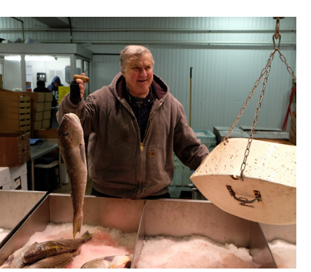
Fish Market, opened 2005

accomplished through partnership between the City and Hunts Point community: