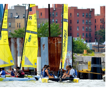
HP Riverside Park, opened 2007