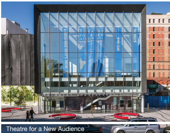
Theatre for a New Audience