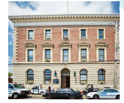
Historic building: NYPD 101st Precinct Police Station