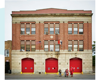
Historic building: Far Rockaway Firehouse, Engine Companies 264 & 328/Hook and Ladder 134