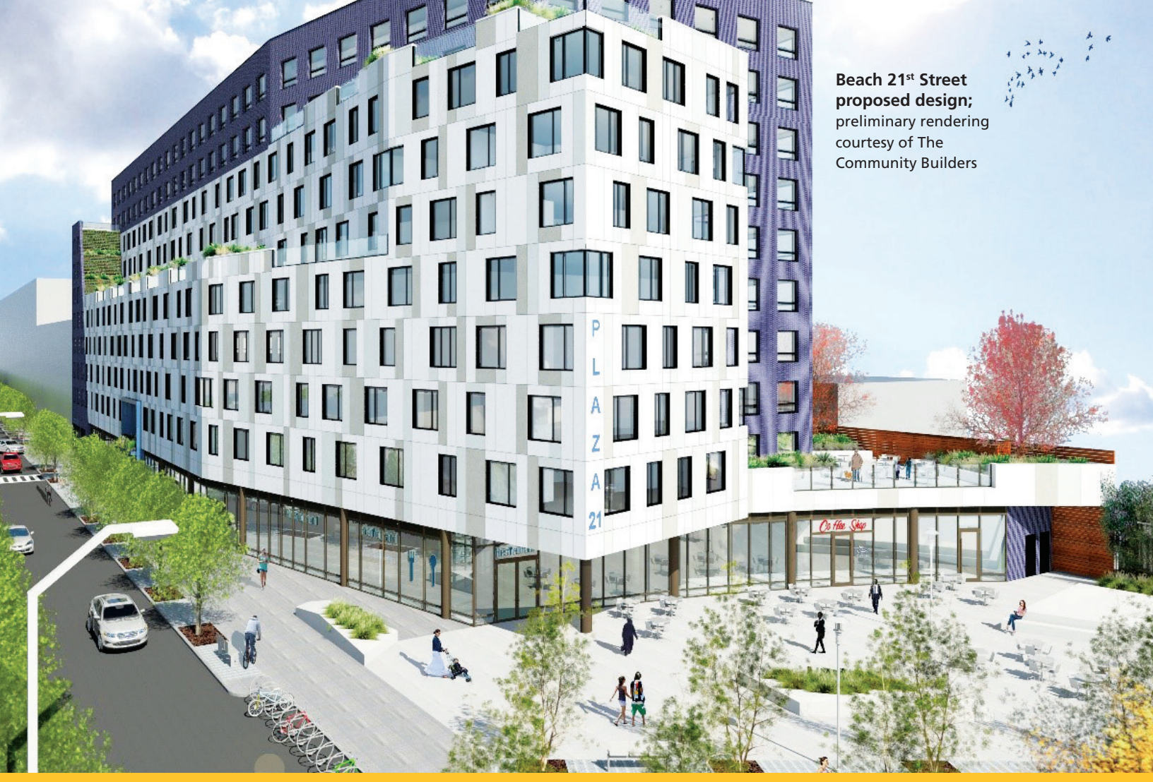
Pending Public Design Commission Approval